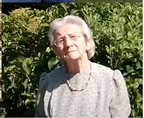
Some of the contributors to our online services